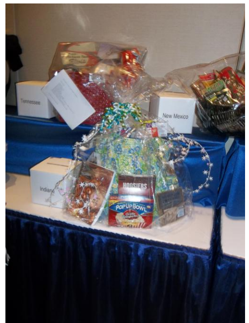
Indiana Basket at National Conference